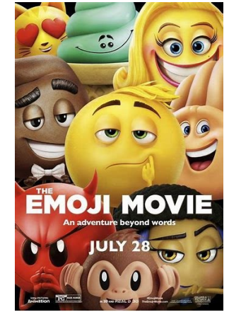
THE EMOJI MOVIE FRIDAY, AUGUST 4TH