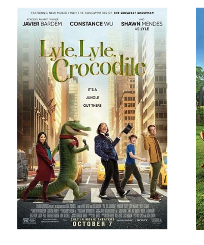
LYLE, LYLE CROCODILE FRIDAY, JULY 21ST