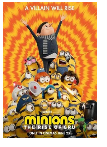
MINIONS: THE RISE OF GRU MONDAY, JULY 3RD