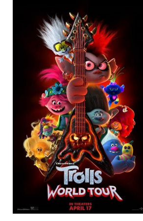
TROLLS WORLD TOUR FRIDAY, JUNE 2ND