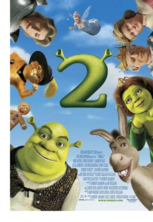
SHREK 2 FRIDAY, JULY 7TH