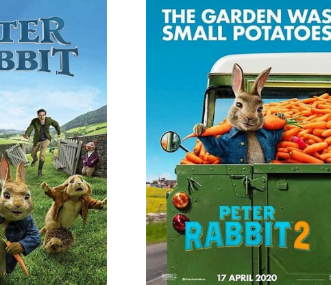
PETER RABBIT MONDAY, JULY 24TH