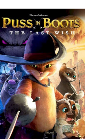
PUSS IN BOOTS: THE LAST WISH