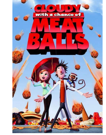
CLOUDY WITH A CHANCE OF MEAT BALLS FRIDAY, AUGUST 11TH