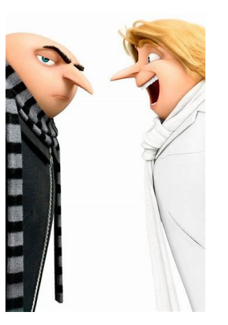
DESPICABLE ME 3 FRIDAY, JUNE 30TH