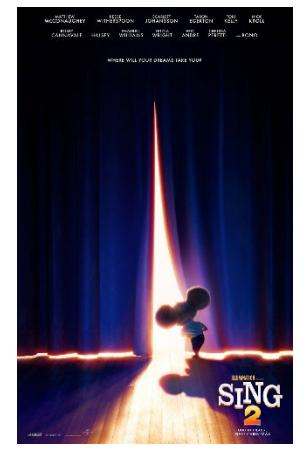
SING 2 SING ALONG FRIDAY, JULY 14TH